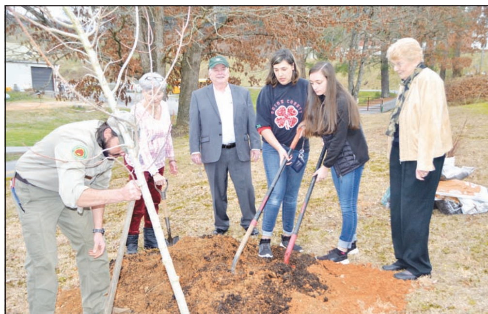
The planting of a new tree commemorating Arbor Day on Friday, Feb. 15, at the Old Blairsville Cemetery.